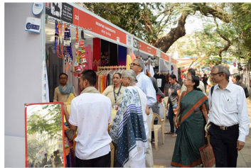
Past edition of KGF

Mumbai's pride, The Kala Ghoda Arts Festival will be back on the streets from February 4 to 12 this year. Themed Past <-> Forward the festival will host a wide array of programmes in over 14 domains such as dance, music, literature, theatre, food, cinema, heritage walks, standup comedy, street art, urban design, architecture and more. The festival will be hosted at 10 iconic venues which will include older ones like K Dubash Marg, Chhatrapati Shivaji Maharaj Vastu Sangrahalaya and Cross Maidan as well as new additions like YB Chavan Centre, IF.Be, and the Cooperage Bandstand Garden.