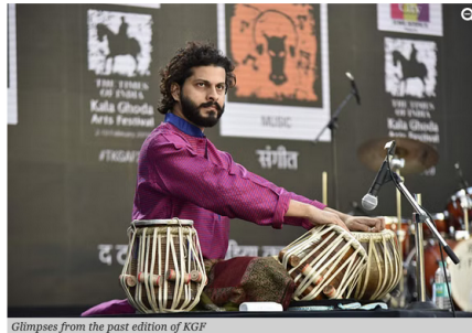
Glances from the past edition of KGF

Priyamvada Rana | Published : | 31st January 2023 05:45 PM