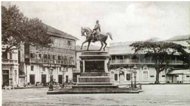
ABOVE The statue of King Edward near Prince of Wales Museum, popularly known as Kala Ghoda.

Support infrastructure like lecture halls, convocation halls and conference facilities, in Mumbai University, Elphinstone College and other institutions, gives the precinct a unique place in the world of art and culture. Kala Ghoda is a magnet for creative talent. Artists, food connoisseurs, fashion designers, architecture buffs; they flock here. With the funds from The Kala Ghoda Arts Festival and support from generous sponsors, The Kala Ghoda Association has helped physically improve the area, restoring buildings and facades, installing people-friendly street furniture and improving the amenities.