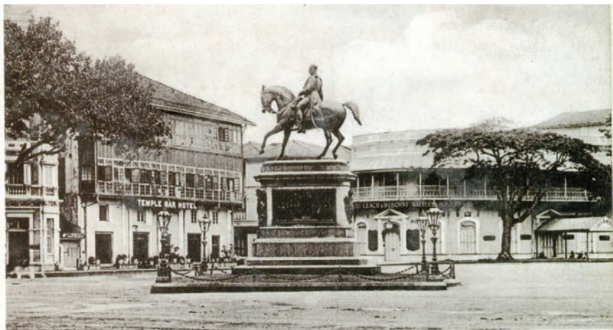
ABOVE The statue of King Edward near Prince of Wales Museum, popularly known as Kala Ghoda.