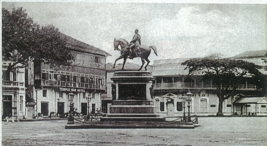
ABOVE The statue of King Edward near Prince of Wales Museum, popularly known as Kala Ghoda.

With the funds from The Kala Ghoda Arts Festival and support from generous sponsors, The Kala Ghoda Association has helped physically improve the area, restoring buildings and facades, installing people-friendly street furniture and improving the amenities.